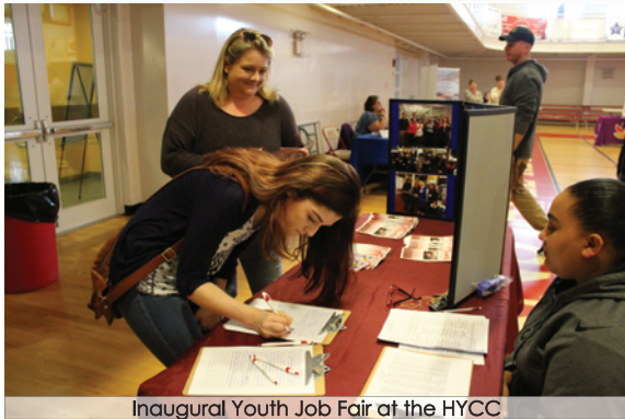
Inaugural Youth Job Fair at the HYCC

By joining the Barnstable Youth Commission, you are able to help your peers and community as a whole. This is a great way for you to be the voice of the community that is so often unacknowledged and unheard.