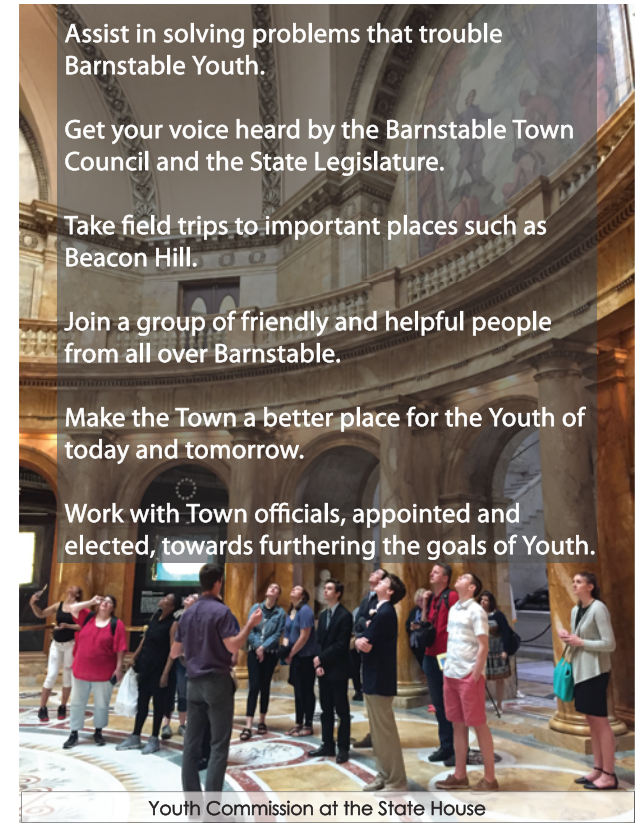
Youth Commission at the State House

Work with Town officials, appointed and elected, towards furthering the goals of Youth.